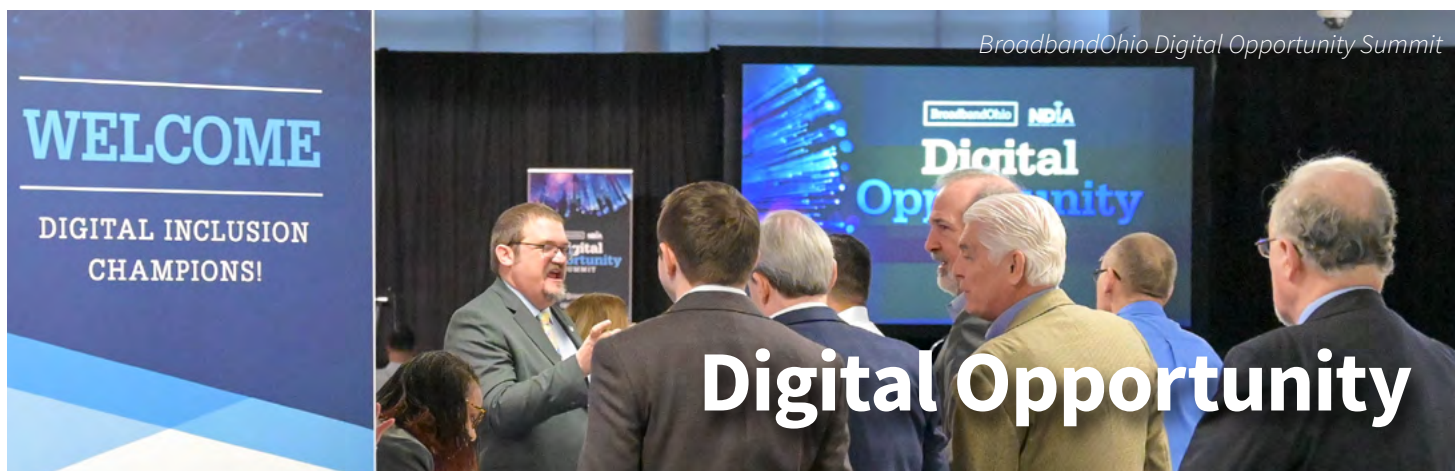
BroadbandOhio Digital Opportunity Summit