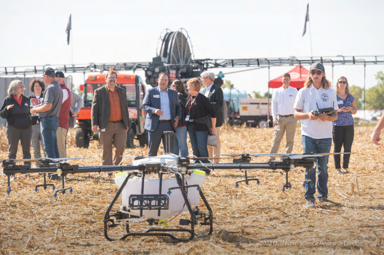
2023 OSU Farm Science Review in London