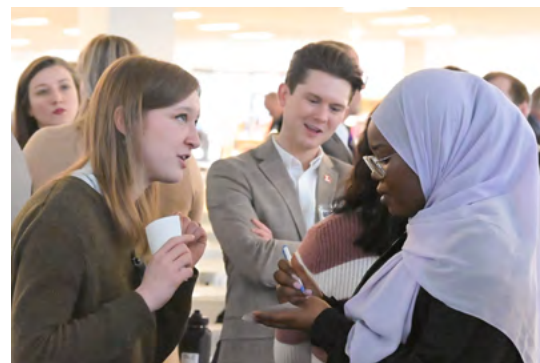
BroadbandOhio Digital Opportunity Summit

On February 16, 2023, BroadbandOhio and the National Digital Inclusion Alliance (NDIA) co-hosted a sold-out, statewide event to kickstart Ohio’s digital opportunity planning process and learn more about local, state, and national efforts to close the digital divide for all Ohioans. The Digital Opportunity Summit celebrated the ways digital inclusion champions are empowering Ohioans to fully engage in their communities, seek and maintain employment, better connect with loved ones, learn, and access healthcare and other essential services. The group looked toward the future as historic investments for high-speed internet are providing resources to close the digital divide at an unprecedented level.