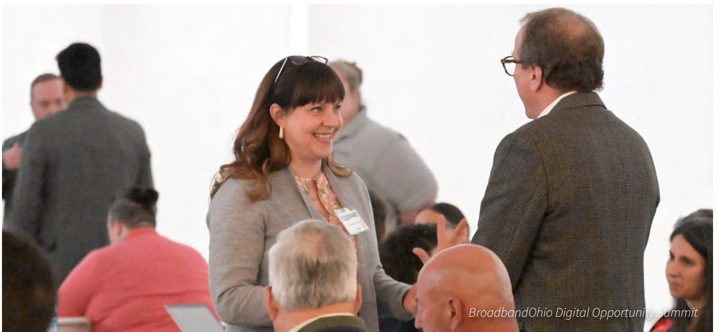
BroadbandOhio Digital Opportunity Summit