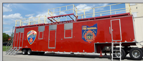
Fire Blast Trailer