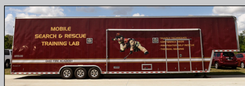
Mobile Search & Rescue Training Lab

The OFA Close to Home series brings training to students while offering the same expert instructors and the Academy's extensive range of apparatus, equipment and training simulators. To better manage time and resources, students can select from a range of courses taught at a location and time near them. Close to Home has three delivery types: