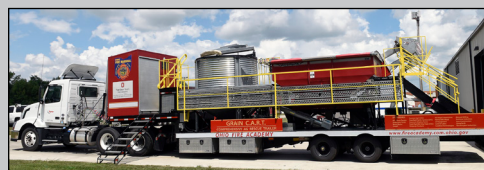
Grain Bin Trailer