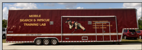
Mobile Search & Rescue Training Lab

The OFA Close to Home series brings training to students while offering the same expert instructors and the Academy's extensive range of apparatus, equipment and training simulators. To better manage time and resources, students can select from a range of courses taught at a location and time near them. Close to Home has three delivery types: