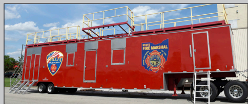
Fire Blast Trailer