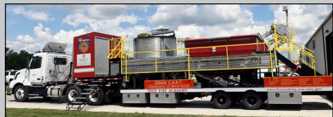
Grain Bin Trailer