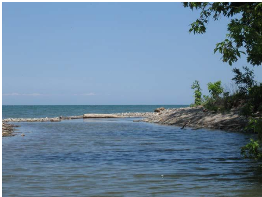
Arcola Creek Lacustrary, Lake Co.