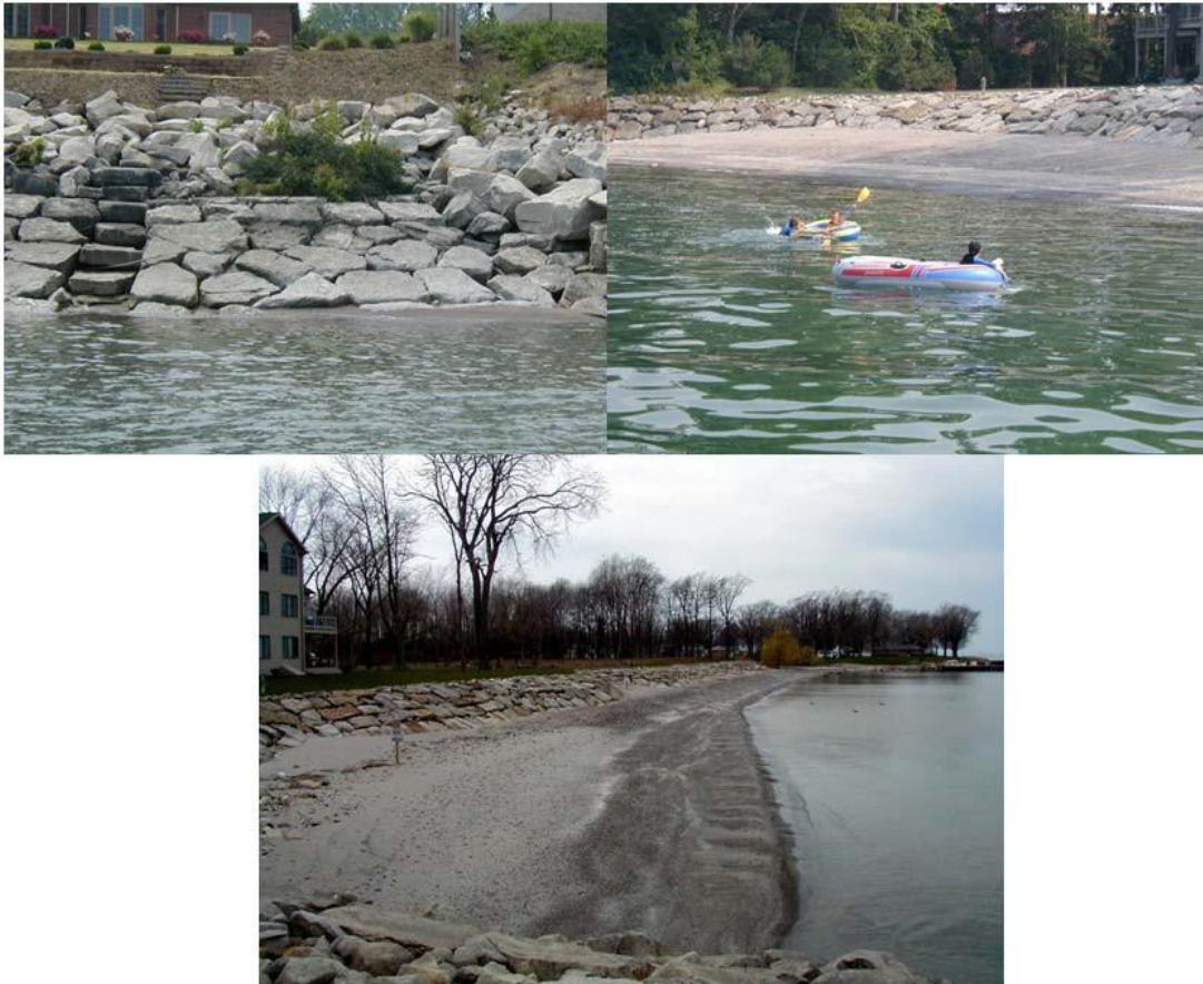
Figure 1. Three photographs of sloping, smooth-faced revetments in Erie and Lorain Counties. Note the accumulation of sand and ease of access to the water.

tailored to the local conditions would be appropriate. In this area, the vertical, highly reflective shorelines create a unique habitat that sustains a unique fish community. It should be noted that projects that best mimic natural conditions are likely to be the most stable over the long term and will likely require the least amount of maintenance over time.