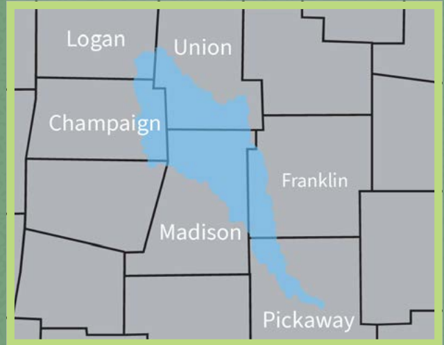
Big Darby Watershed

The Big Darby watershed is a freshwater, aquatic high-quality ecosystem encompassing 557 square miles in central Ohio (Madison, Champaign, Logan, Pickaway, and Union counties). It is drained by Big Darby Creek, Little Darby Creek and other smaller tributaries. The 80 mile-long stream is home to many rare and endangered freshwater mussels and fish.