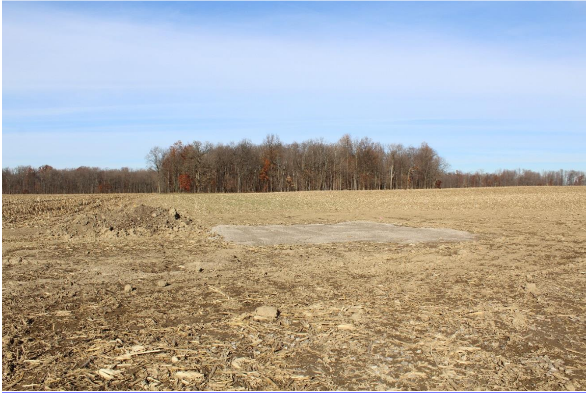
Figure 3: Blind Inlet installed to intercept surface drainage into subsurface drainage system