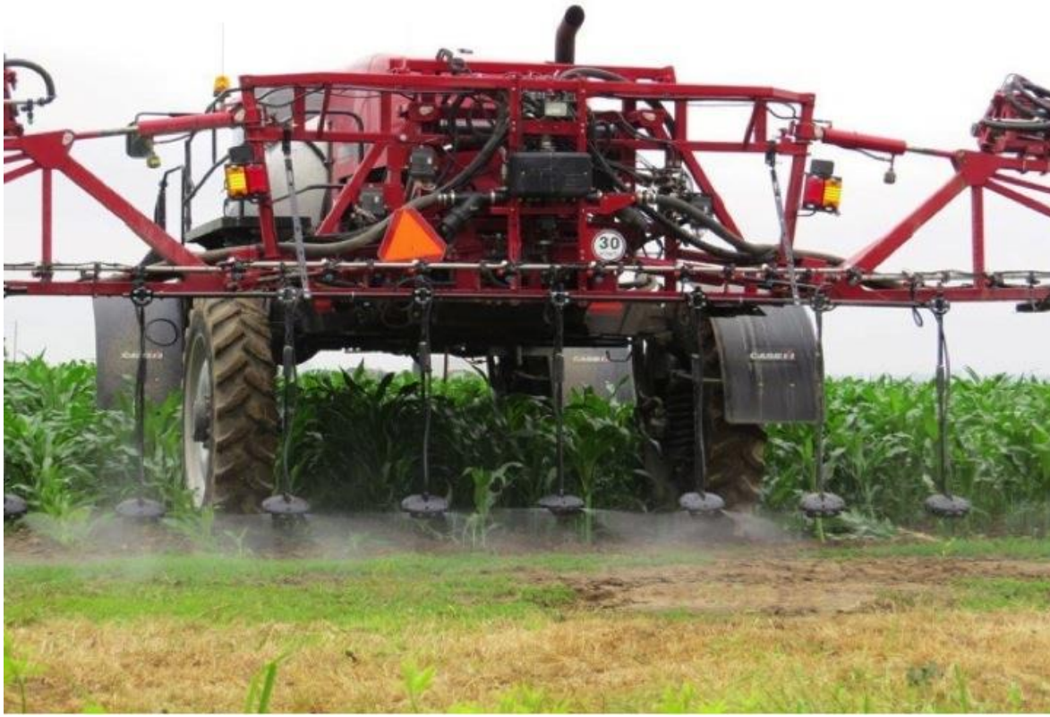
Figure 10: In-Row Fertilizer Application