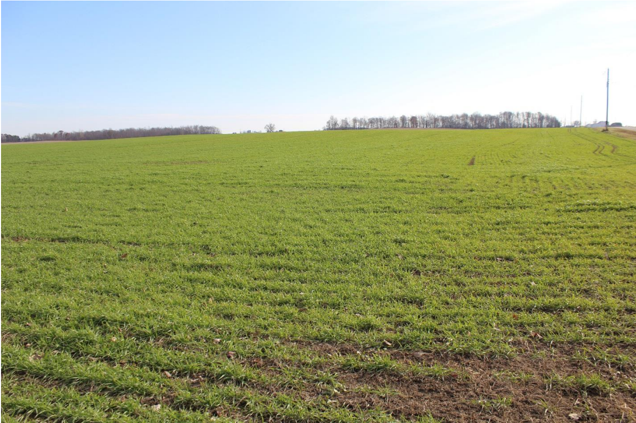
Figure 8: Cover Crops