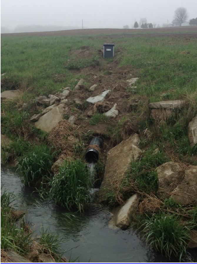
Figure 5: Controlled Drainage System