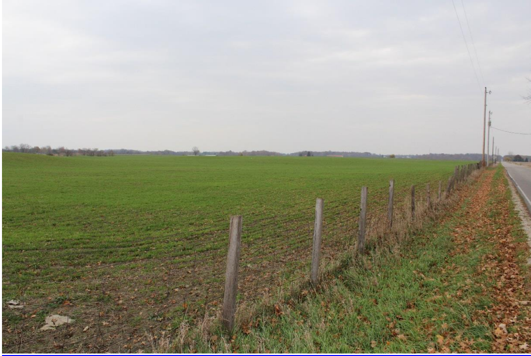
Figure 9: Cover Crops