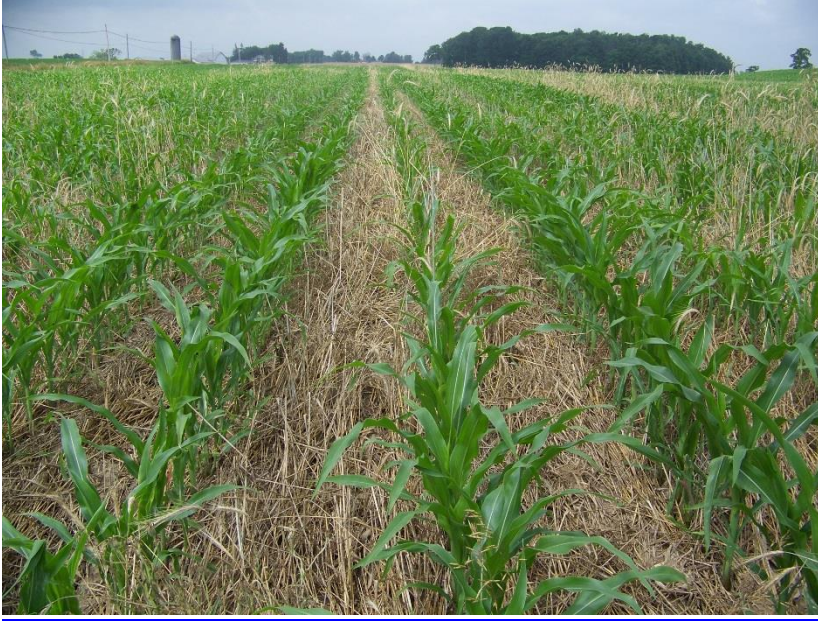
Figure 7: No-Till corn with in-row application of fertilizer