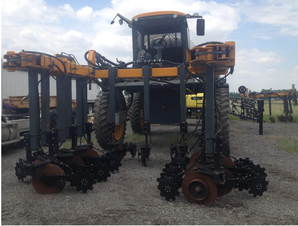
Figure 1: Air Seeder user in Cover Crop planting promotion