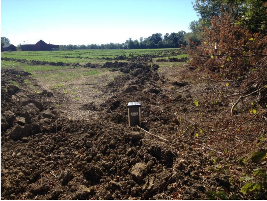
Figure 6: Controlled Drainage System