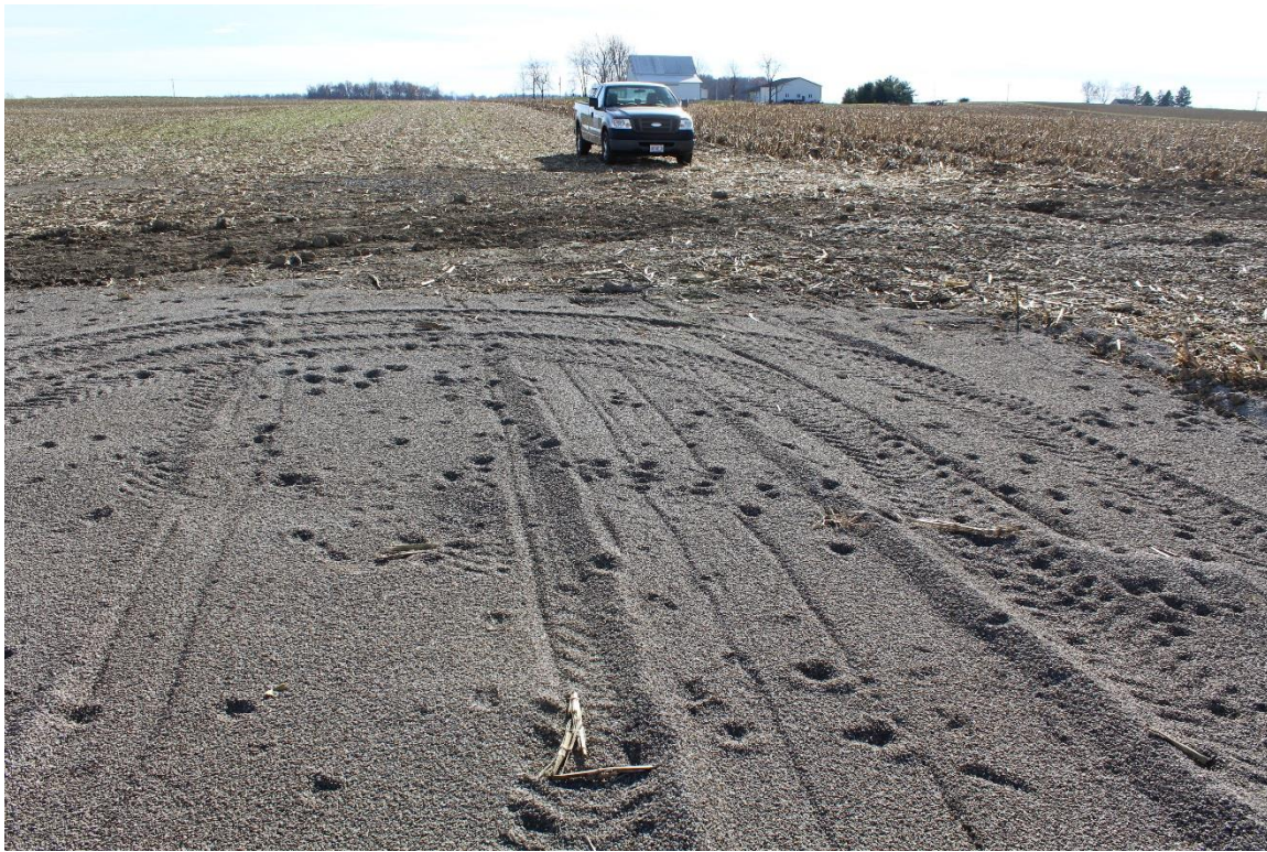
Figure 4: Blind Inlet installed to intercept surface drainage into subsurface drainage system