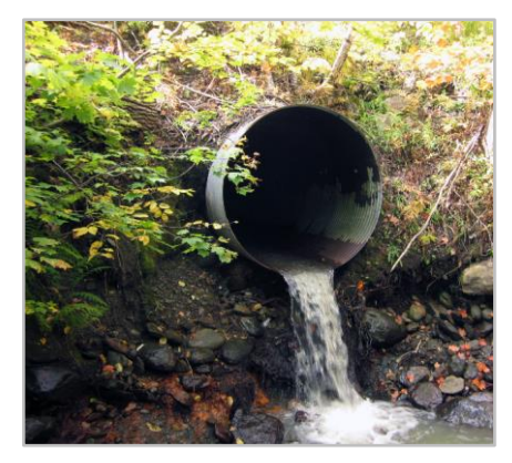
Don't discharge your power washing wastewater directly into a lake, river or other waters of the state unless you have a permit for the discharge.

Ohio EPA does not require that a specific type of containment method be used for wastewater collection. However, the system must be adequately designed to prevent wastewater from entering a storm drain or from running off-site. A permanent containment pad with berms and a pump system can be used. There may be other methods you can use to manage wastewater at the site in addition to the following: