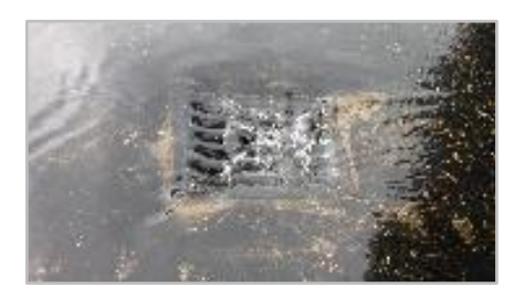
Don't discharge your power washing wastewater into storm drains. This could lead to violations and penalties.