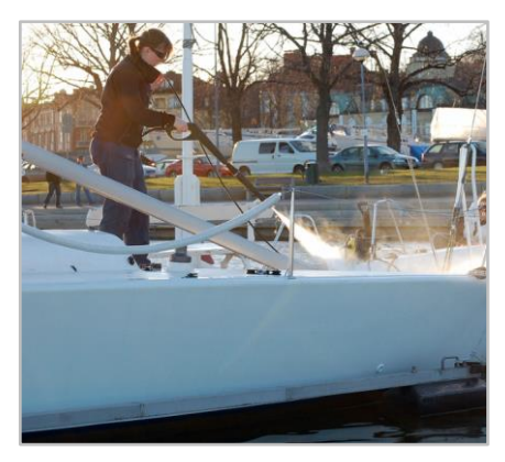
Even if you are using biodegradable soaps or detergents, or just water alone, your wastewater is still defined as an industrial wastewater and must be properly managed.

Inspect the site to find out if there is access to the POTW through a sanitary sewer. Drains and gutters found outside buildings, in parking lots or along streets are usually not sanitary sewers. These are usually storm sewers that lead directly to a stream, lake or other water body. You cannot discharge wastewater directly into storm drains. Also, you should not discharge any wastewater into a drain or sewer system if you do not know where it leads. If you are unsure, you can contact the local POTW to get more information about the sewer system in your area.