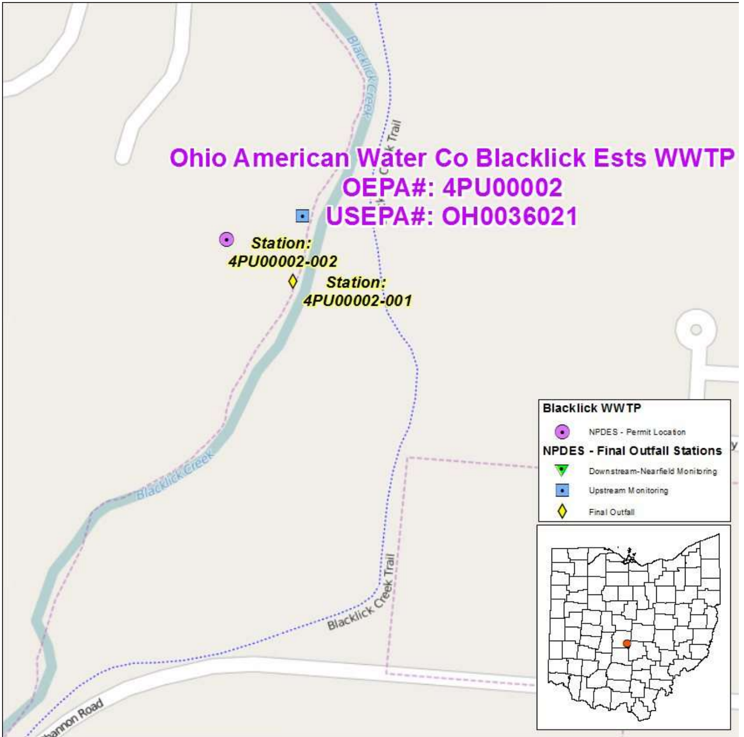
Figure 1. Location of Blacklick Estates