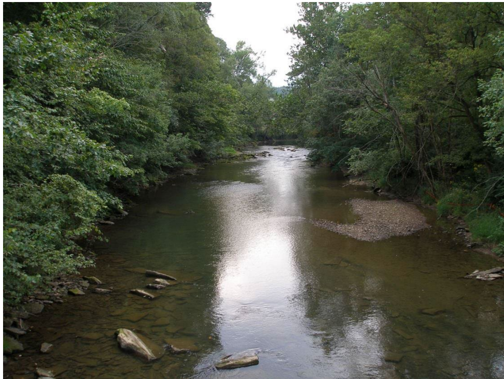
Clear Fork of the Mohican River at Benedict Road bridge outside of the Village of Butler.

Ohio EPA Technical Report AMS/2007-MOHIC-3