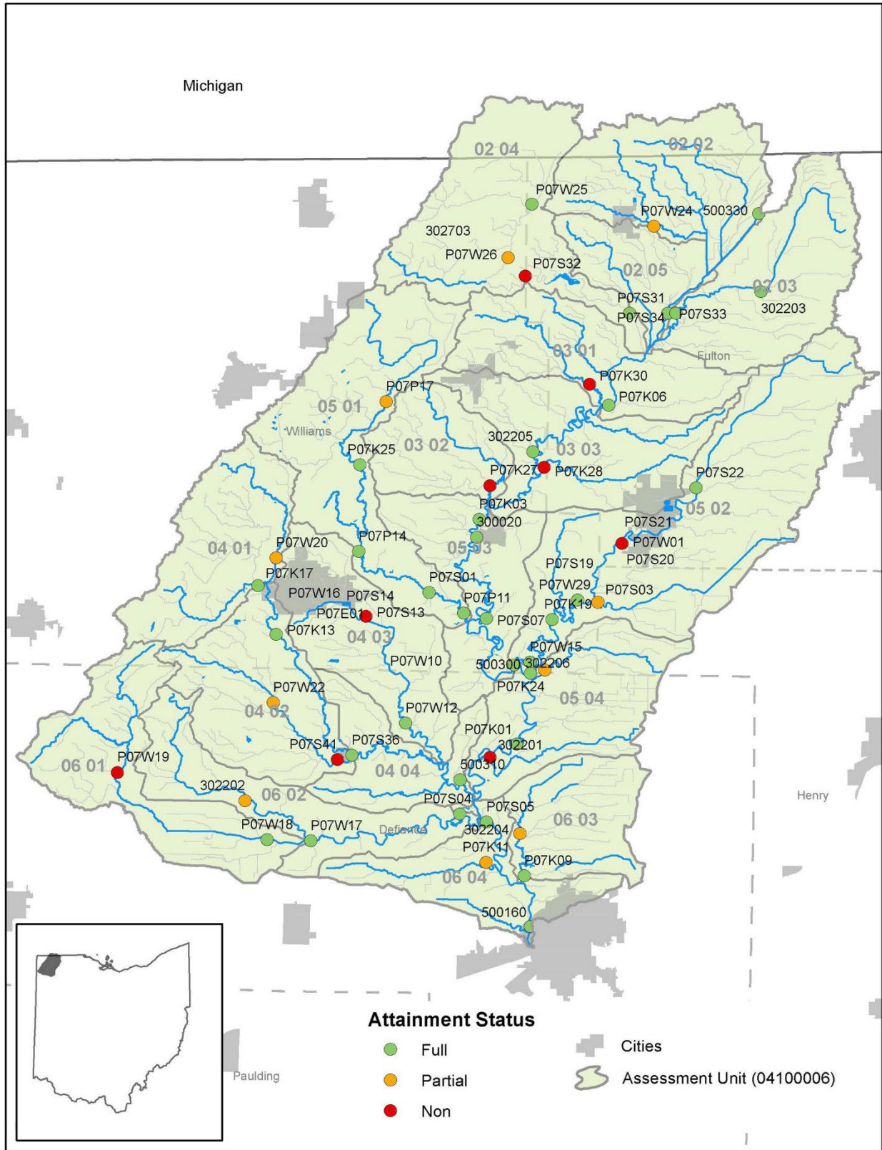
Figure 1 — Map summarizing ALU attainment status in the Tiffin River watershed from 2012-2014.