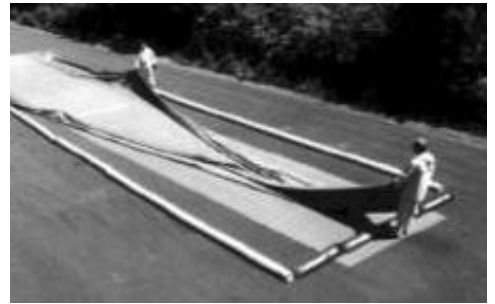
A portable containment pad can be constructed to collect wastewater from power washing.

Ohio EPA does not require that a specific type of containment method be used for wastewater collection. However, the system must be adequately designed to prevent water from entering a storm drain or from running off-site. A containment pad, berms and pump system can be used to contain wastewater and divert it to a holding tank or sanitary sewer. Besides the following, there may be other methods you can use to manage wastewater at the site: