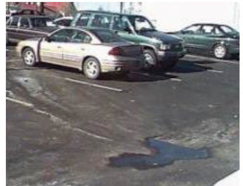
Drains in parking lots usually lead to storm sewers. You CANNOT discharge your power washing wastewater into a storm sewer.

A company that wants to discharge wastewater directly to a creek, river or other water body must obtain a National Pollutant Discharge Elimination System (NPDES) permit from Ohio EPA's DSW. The permit must be received before the business can discharge. A permit would be required for each job site with a direct discharge