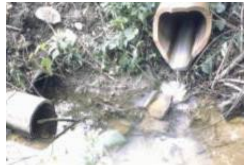
Don't discharge your power washing wastewater directly into a creek, river, or other waters of the state unless you have