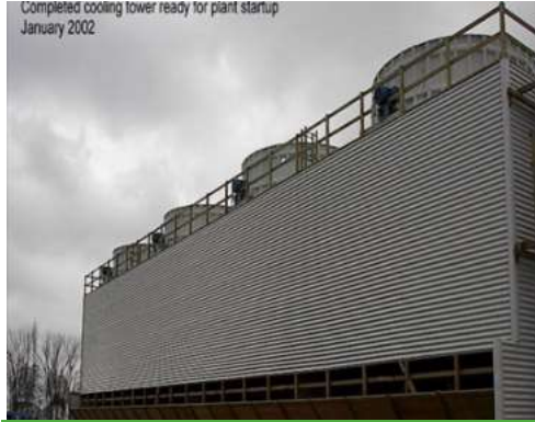
Completed cooling tower ready for plant startup January 2002 Cooling Water