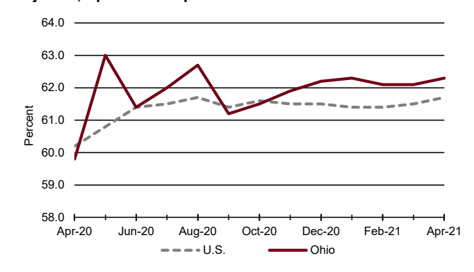
Ohio and U.S. Labor Force Participation Rates, seasonally adjusted, April 2020 – April 2021

In April, the labor force participation rate in Ohio was 62.3%, up from 62.1% in March 2021 and up from 59.8% in April 2020. During the same period, the national labor force participation rate was 61.7%, up from 61.5% last month and up from 60.2% one year ago.