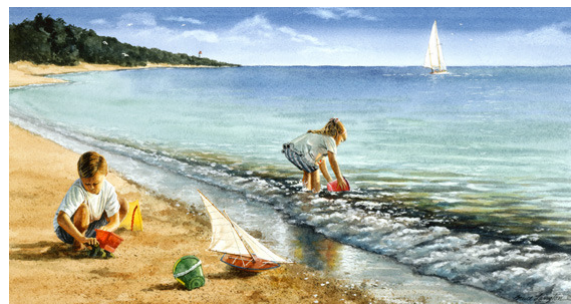
"A Time to Play" by Bruce Langton from B is for Buckeye . Used with permission.

http://www.bruce-langton.com/bruce-langton-workshops.htm