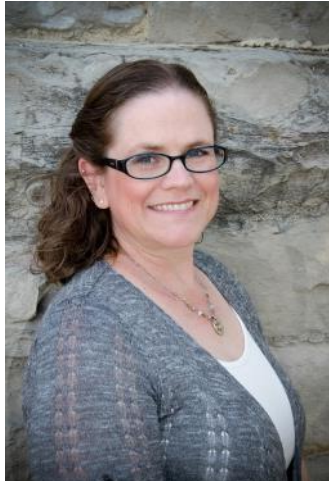
Author photo and biographical information courtesy Holiday House; used with permission.