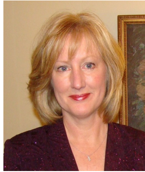
Author photo courtesy Candlewick Press; used with permission.