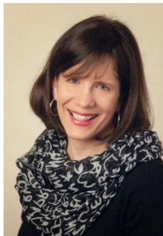
Biographical information courtesy Shelley Pearsall.