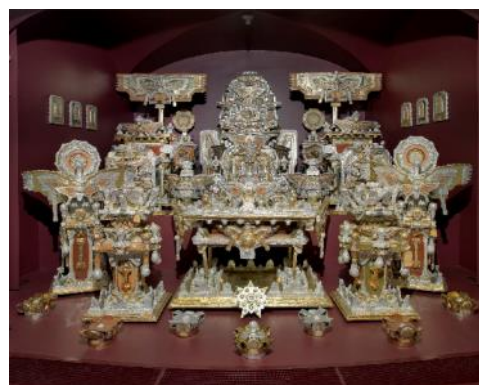
Image of The Throne of the Third Heaven of the Nations' Millennium General Assembly

From the Smithsonian American Art Museum, explore what little biographical information is known about Hampton, and view high-resolution images of The Throne of the Third Heaven of the Nations' Millennium General Assembly and accompanying crowns.