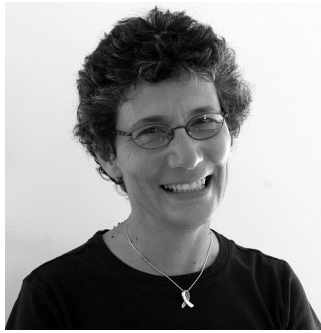
Author photo and biographical information courtesy Houghton Mifflin Harcourt; used with permission.