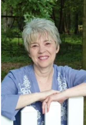
Permission to use author photo granted by HarperCollins. Photo credit: Don Russell. Biography courtesy Mary Doria Russell.

“On the afternoon of October 26, 1881, the Earps were incorruptible, intrepid lawmen bravely marching off to protect the city from gun-toting outlaws. The next morning, they were cold-blooded killers who’d murdered three men on a public street...”