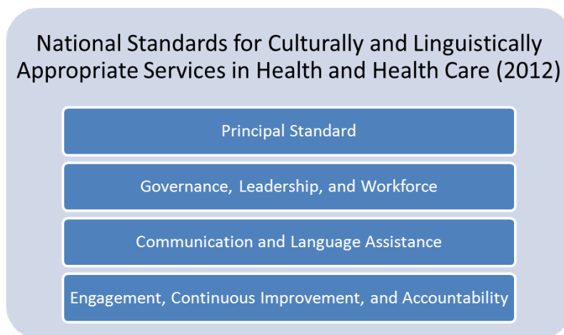
Figure 3: Enhanced National CLAS Standards' Themes

The names of the three themes have been updated both to clarify intent and to broaden the scope of their interpretation and application.