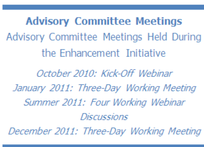
Figure 5: Advisory Committee Meetings

Blueprint. The Enhancement Initiative Project Team 2 convened several meetings with the Advisory Committee throughout the Enhancement Initiative, either in person or virtually (see Figure 5).