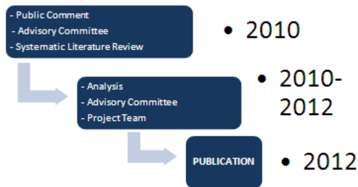
Figure 4: Phases of the National CLAS Standards Enhancement Initiative

Discussions began in 2009 at the HHS Office of Minority Health regarding a plan to enhance the National CLAS Standards. The National CLAS Standards Enhancement Initiative formally began in 2010 following the same development process as the original National CLAS Standards project in 1999–2001. The development process had three major components: public comment, the Advisory Committee, and a systematic literature review.