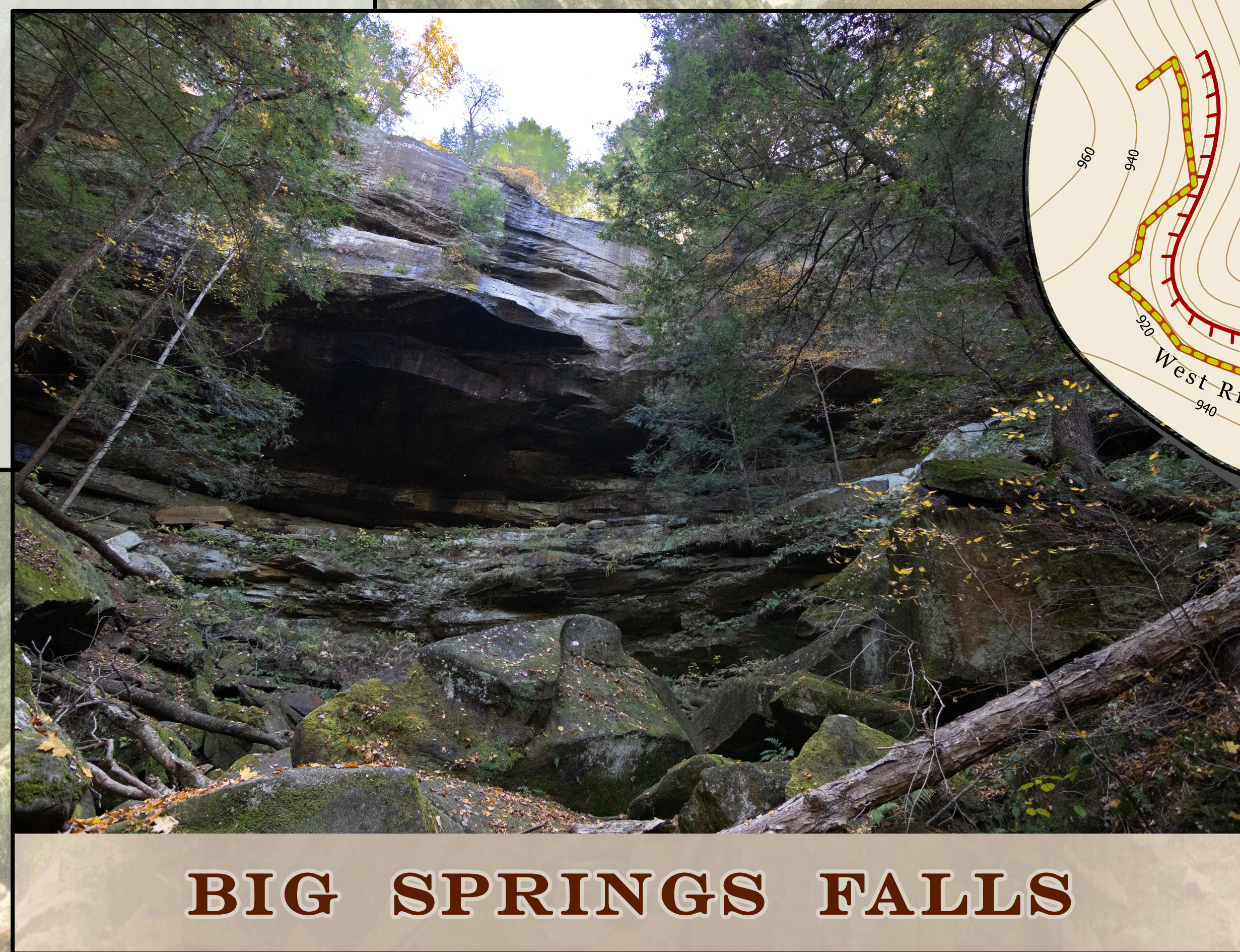
BIG SPRINGS FALLS