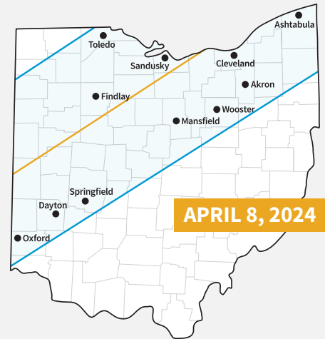
— Center line of total eclipse — Outer boundaries of the path of totality viewing area