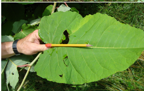
Top row, L to R: Infestation of giant knotweed; shorter flower clusters of giant knotweed; an infestation of flowering Japanese knotweed along a road.