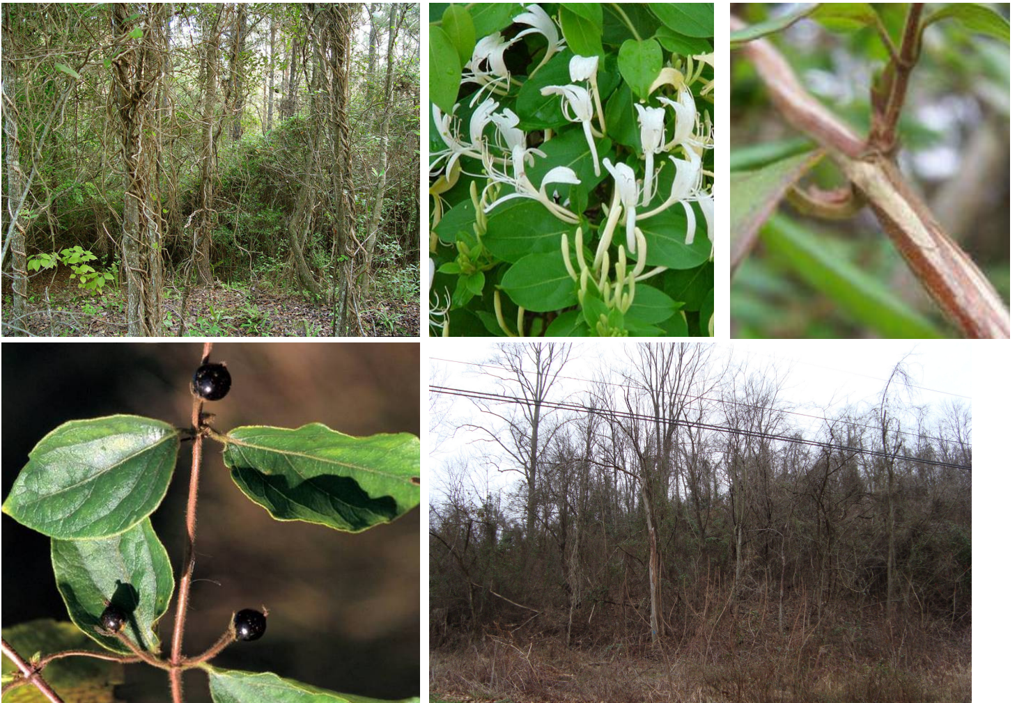
Clockwise from top left: Spiral growth habit of the vine; fragrant spring flowers; striped appearance of the woody vine; a disturbed woodland that is heavily infested with Japanese honeysuckle; blue-black berries that ripen in fall

Japanese honeysuckle has small oblong leaves that are arranged oppositely along the stem. Young stems are hairy and light reddish brown. Fragrant white or yellow flowers are present in late May to early June. Berries develop in late summer and ripen to blue-black glossy fruits in September through October. Seeds are eaten and dispersed by a variety of wildlife species.