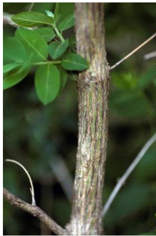
Top Row, L to R: flowers of amur honeysuckle, fruit of amur honeysuckle; flowers of tatarian honeysuckle; fruit of tatarian honeysuckle Bottom Row, L to R: amur honeysuckle growing in the woods, note the arching form and the lack of vegetation beneath it; bark of bush honeysuckle