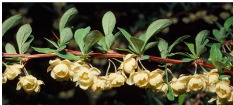
Clockwise from left: Spoon-shaped leaves; twigs, sharp spines, and fruits; dangling white flowers that appear in spring; fall foliage.