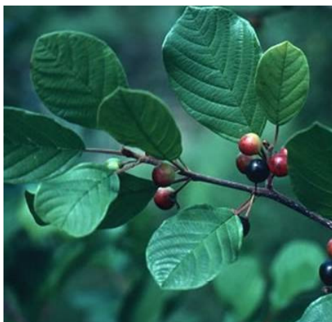
Top Row, L to R: foliage of common buckthorn; 4-petaled flowers of common buckthorn; black fruits of common buckthorn