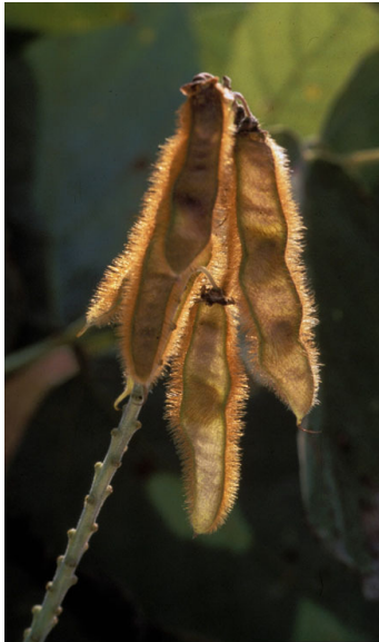
Clockwise from top left: Trifoliate compound leaves; upright purple flowers; kudzu trailing along the ground; hairy flattened seed pods; kudzu smothering a shrub in a Columbus, OH ravine.