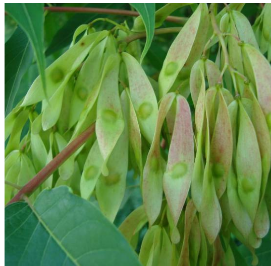
Top Row, L to R: Tree-of-heaven in winter; long compound leaf, stout twig; smooth bark with vertical fissures. Bottom Row, L to R: A tree-of-heaven growing in foundation of a building; winged seeds of female tree-of-heaven