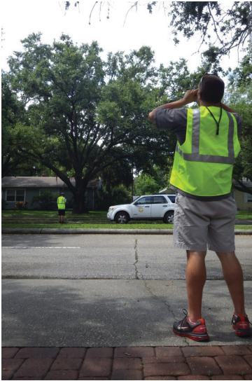
Figure 2. Urban trees can often impact multiple targets. Credits: Gitta Hasing

Time Required to Complete: Approximately 20 minutes for a basic, 360-degree visual assessment, using a diameter tape and a digital hypsometer (Figure 2). Time required should decrease as the user gains greater familiarity with the process and form.