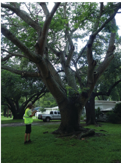
Figure 1. The three risk assessment processes reviewed all included data entry forms to facilitate the systematic collection of standardized information.