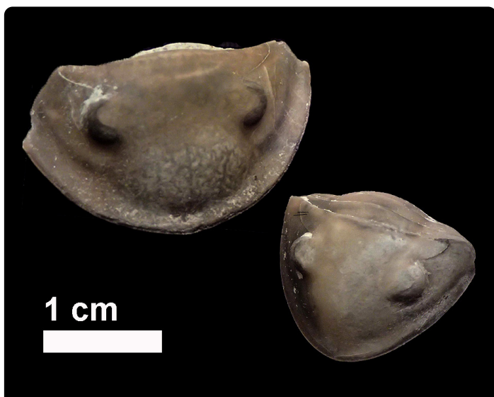
Figure 2. Enrolled, immature specimens of two species of Isotelus . Left: I. maximus ; Right: I. gigas . Note the more triangular outline of I. gigas . Both are from Warren County, Ohio.