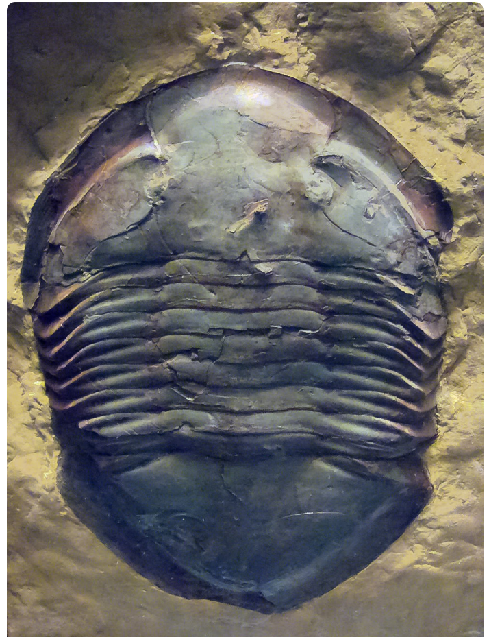
Figure 1. Specimen of an Isotelus trilobite collected during construction of the Huffman Dam, near Dayton, in 1919. This large specimen measures 14.5 inches (37 centimeters) long.

Predators of trilobites included eurypterids (sea scorpions) and other arthropods, jawed fishes, and cephalopods (tentacled