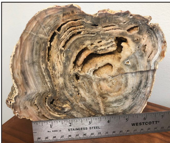
Figure 1. Fossilized stromatoporoid sponge from Highland County, Ohio. After death and burial, water permeated the organism's internal structure, depositing silicate minerals and preserving the internal shape of the sponge.

Underlying the Lilley is the Bisher Formation, which is comprised of silty to shaley dolomites that weather brown-orange. This formation differs from the overlying units