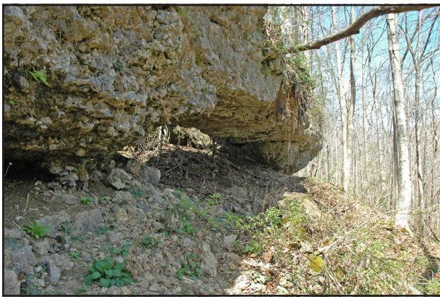
Figure 3. Miller Natural Bridge visible from the Arch Trail within the Peebles Dolomite.