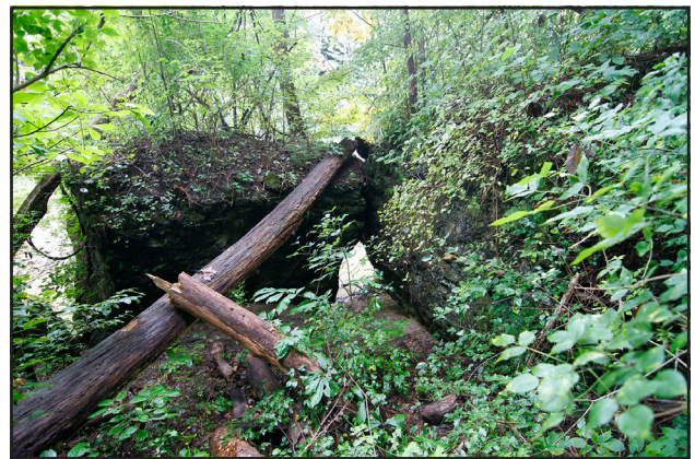
Figure 4. Slump blocks along Rocky Fork Gorge.