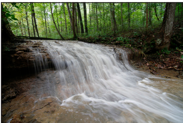
Figure 5. Waterfall flowing over the Bisher Formation at the beginning of the Falls Trail.