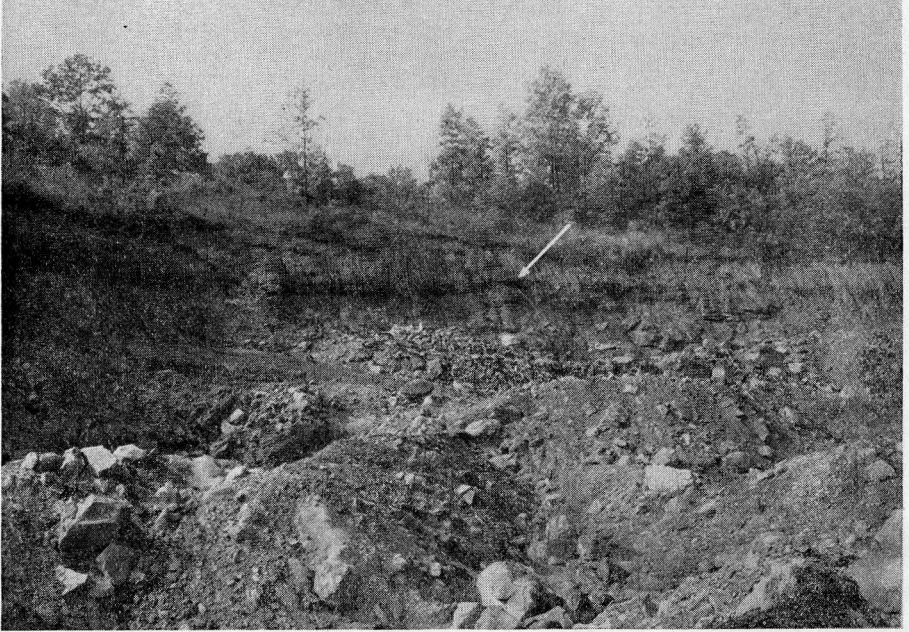
FIG. 2. Strip mine of the L. and M. Coal Co., section 31, Ward Tp., Hocking Co., Ohio Arrow points to Lower Freeport coal and Dorr Run shale.