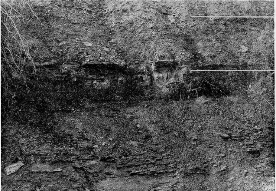
FIG. 3. Close view of Lower Freeport coal and Dorr Run shale shown in Fig. 2. White lines indicate top and bottom of the Dorr Run shale. Figs. 2 and 3 show the type exposure of the Dorr Run shale.