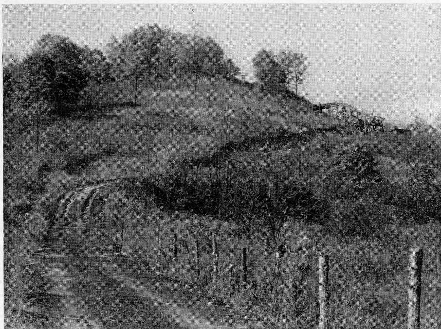
FIG. 1. East approach to the L. and M. Coal Co.'s strip mine on the southwest side of the Dorr Run valley, section 31, Ward Tp., Hocking Co., Ohio. The strip mine lies behind the tipple.