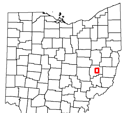
Location of Old Washington 1:24,000 quadrangle in Ohio.

Basemap derived from various State of Ohio datasets Projection is Ohio coordinate system, south zone North American Datum 1983