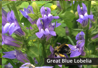
Great Blue Lobelia