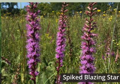
Spiked Blazing Star