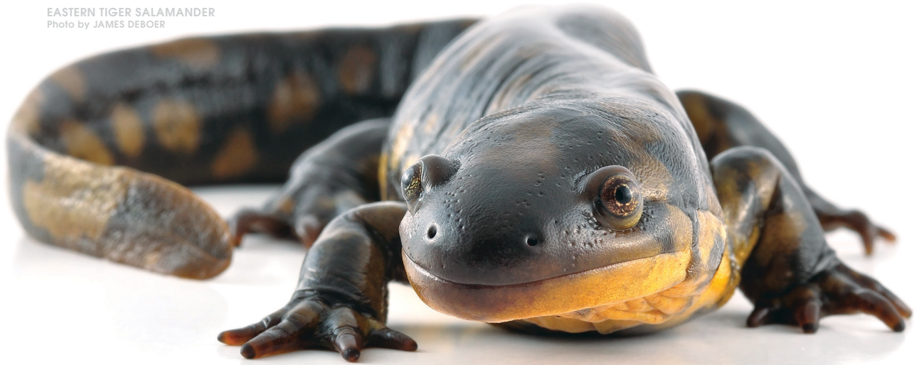
EASTERN TIGER SALAMANDER

A number of programs and resources are available to educators, volunteers, organizations, and the general public from the Division of Wildlife. These programs help meet our mission: To conserve and improve fish and wildlife resources and their habitats for sustainable use and appreciation by all.