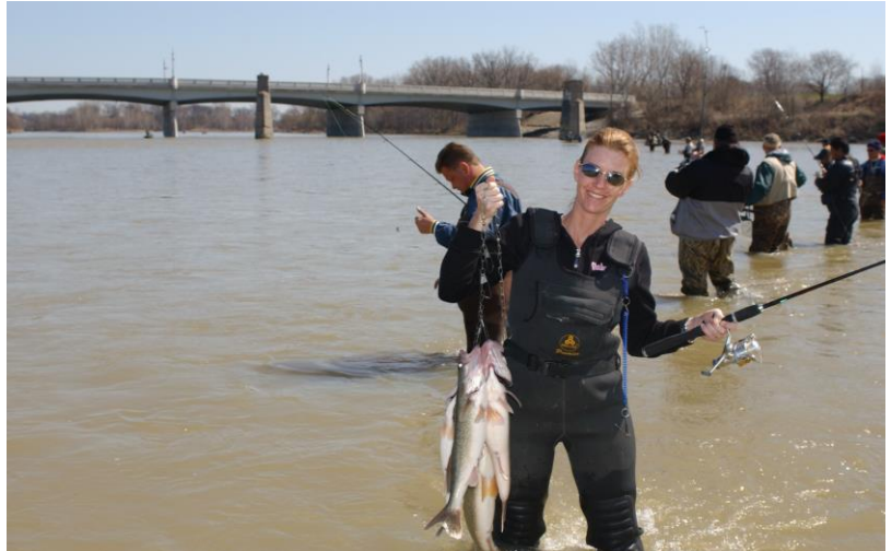
Anglers flock to the Maumee River each spring to take advantage of early-season shoreline and small-boat fishing for walleye