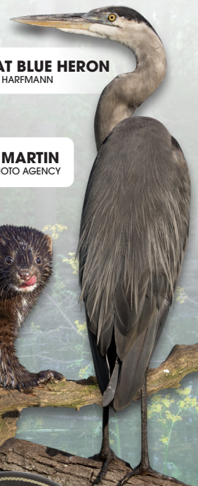
GREAT BLUE HERON BY NINA HAREFMANN