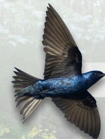
PURPLE MARTIN