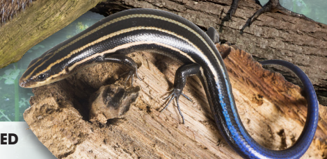
FIVE-LINED SKINK BY IRINA KOZH