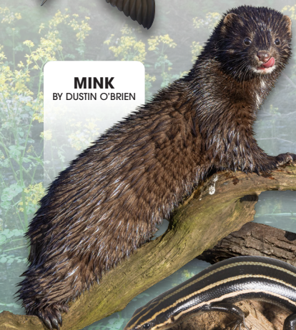
MINK BY DUSTIN O'BRIEN