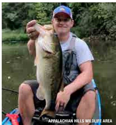
APPALACHIAN HILLS WILDLIFE AREA

The Ohio Department of Health lists current guidance on safe consumption of wild-caught fish in Ohio for specific waters and fishes at odh.ohio.gov/ohfishadvisory .