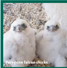
Peregrine falcon chicks