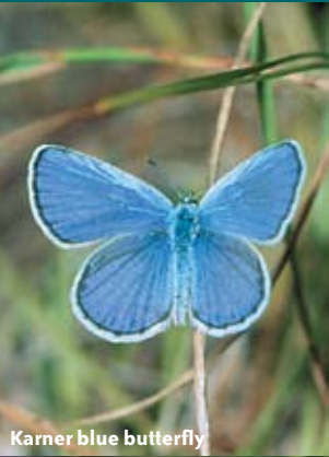
Karner blue butterfly