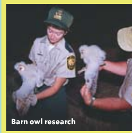
Barn owl research

Bald eagles Barn owls Eastern Plains garter snakes Western banded killifish Paddlefish Freshwater mussels Brook trout Lake sturgeon