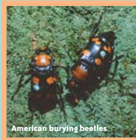
American burying beetles