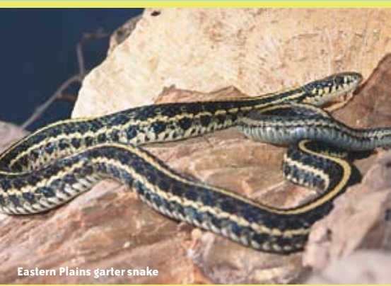
Eastern Plains garter snake