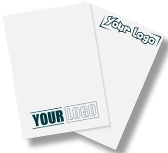
77-015 Small Notepad 77-016 Large Notepad