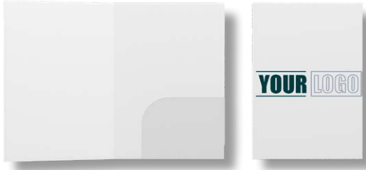
77-017 Pocket Folders

OPI offers many items to share your name and brand.