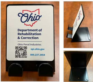
Cell Phone Holder