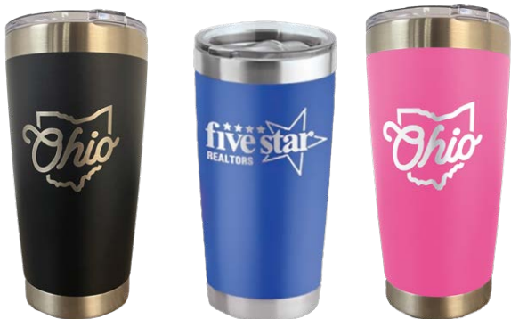
Custom Engraving Examples