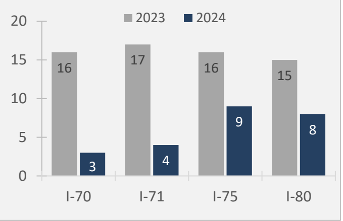
OSHP Commercial Motor Vehicle Enforcements 2023: 381 | 2024: 1,108 | Diff +727 (+191%)