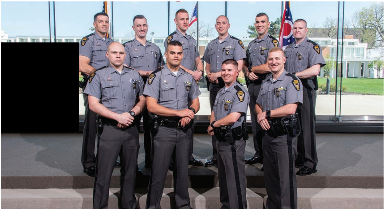
The winners of Ace and Criminal Patrol Awards were recognized on April 22 nd . These troopers worked diligently to look "beyond the plate" in order to remove drugs from Ohio communities and return stolen vehicles to their rightful owners.