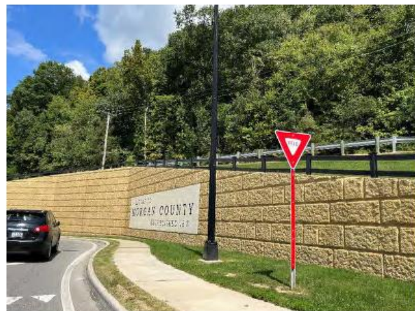
A roundabout in Morgan County.