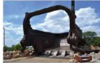
Above: Big Muskie Bucket Below: Morgan's Opera House