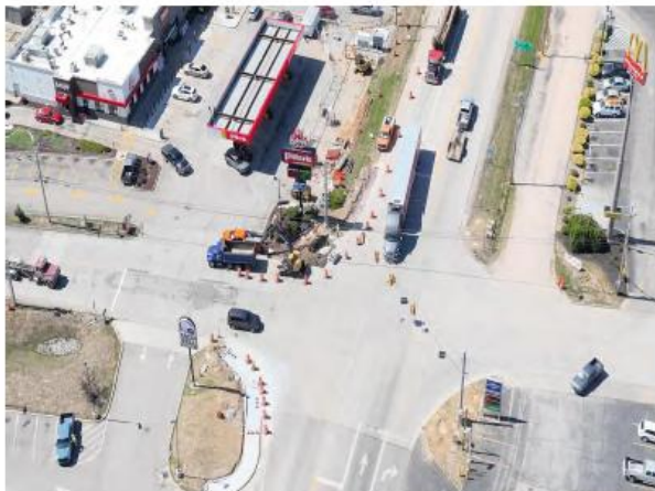
A pedestrian safety project was completed by ODOT D10 at exit 25 off I-77 along SR 78 near Caldwell.

The SR 78 portion is 105 miles and SR 284 is 10 miles = 115 total miles