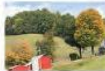
Map available at transportation.ohio.gov/traveling/ohio-byways/appalachian-byway