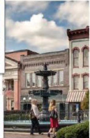
Above: Nelsonville Fountain Below: Caldwell Christmas