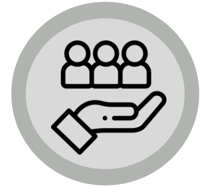
Tax Preparer access