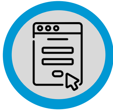
File and amend previously filed returns