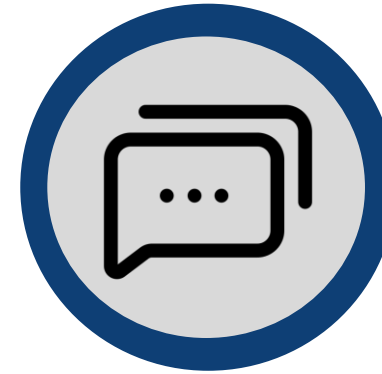
2-way secure messaging