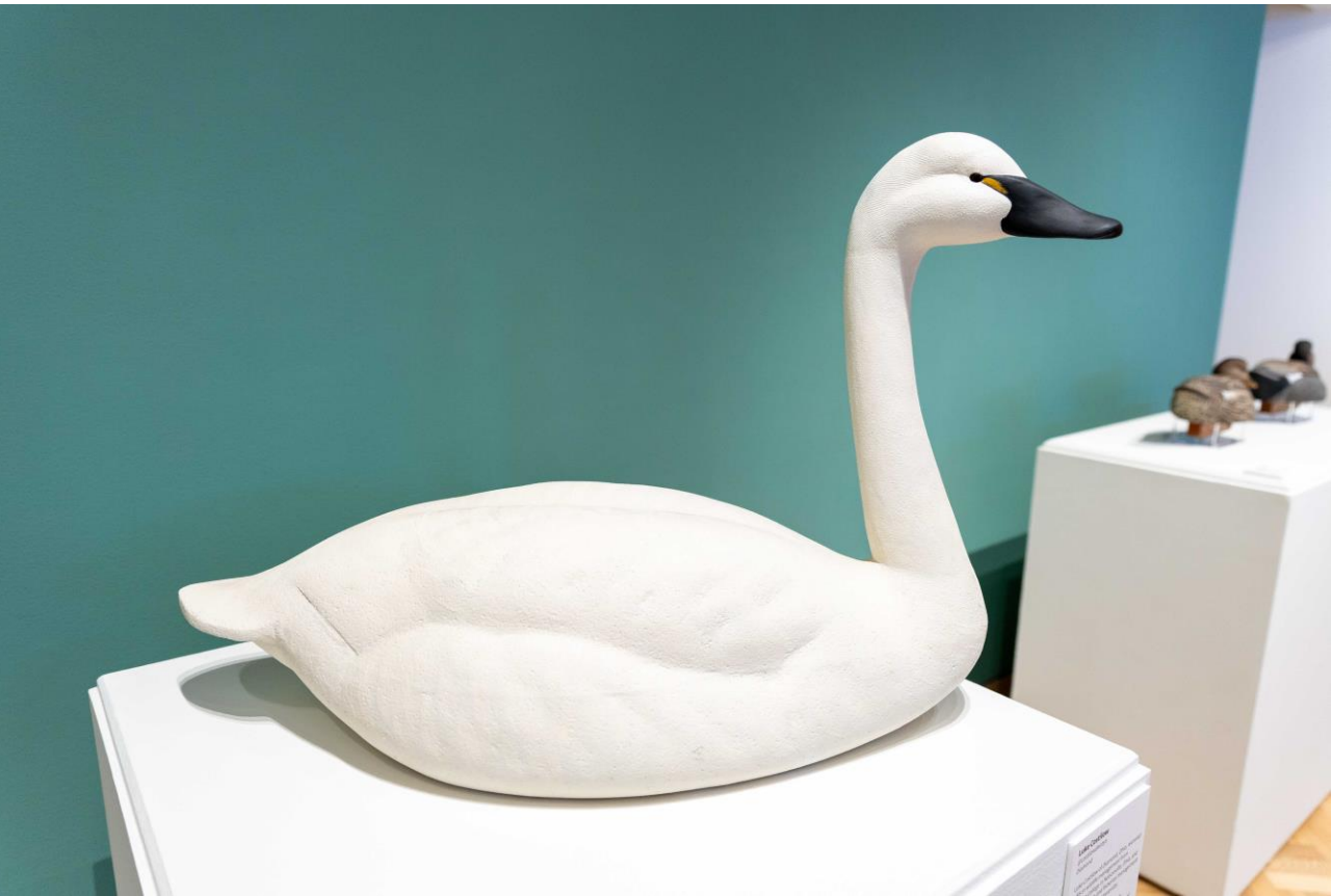
"Tundra Swan"